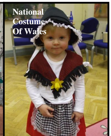
National Costume Of Wales