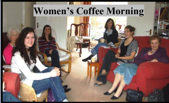
Women's Coffee Morning